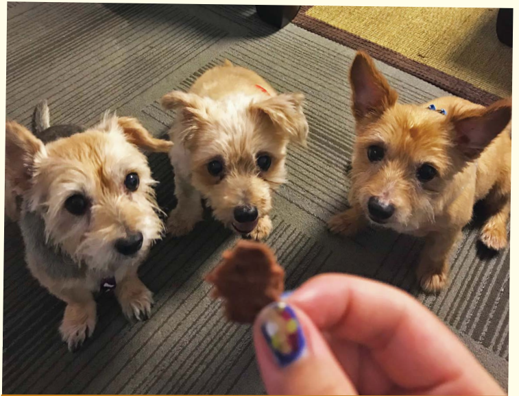
LOLLIE LOULOU, BONNIE AND POOH BEAR

Initially frightened of certain toys, Pebbles has discovered her playful side as she enjoys leaping around and is now having a great time learning how to play.